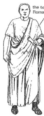
the toga of a Roman citizen