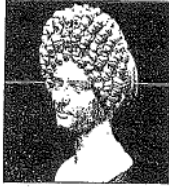
Hairstyles were often quite elaborate

Women wore sleeveless tunics made from linen or cotton, or, if they were very rich, silk. They wore coloured shawls over their tunics and as much jewellery as they could afford.