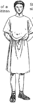
Slaves wore simple tunics made of coarse cloth or felt