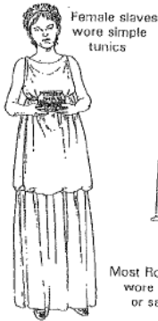
Female slaves wore simple tunics